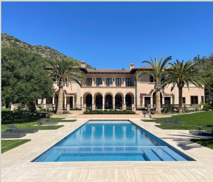
Pool copings, pavers, facade Richard Manion Architecture