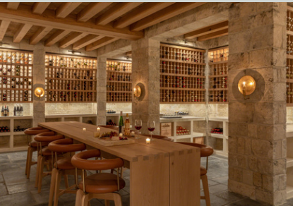
Stone walls & flooring Oz Architects