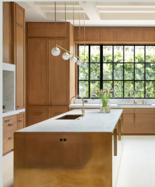
Custom Countertop Detail