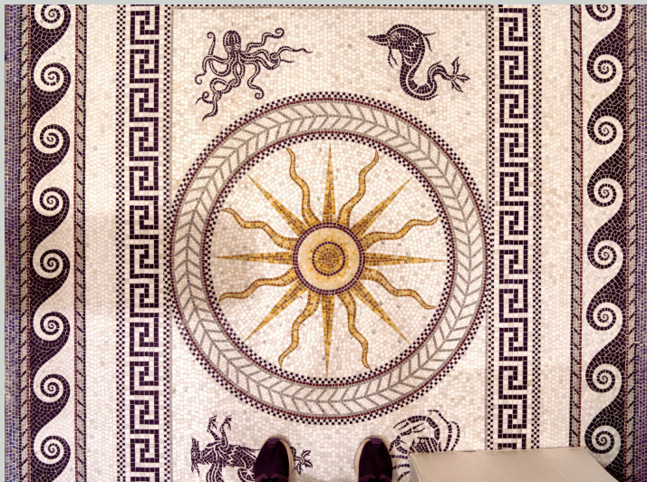
Custom Mosaic Tile Flooring