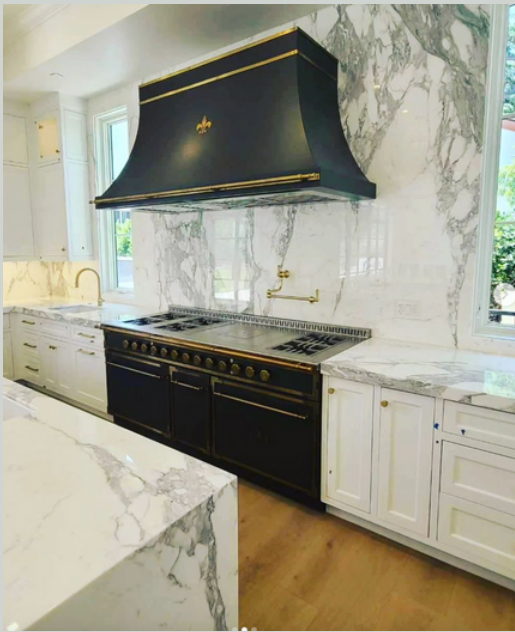
Kitchen Surfaces The JRC Group