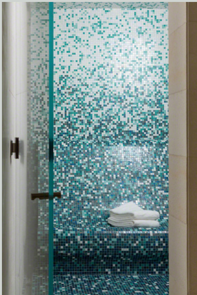
Zellij tile shower / Custom tile shower with curved bench