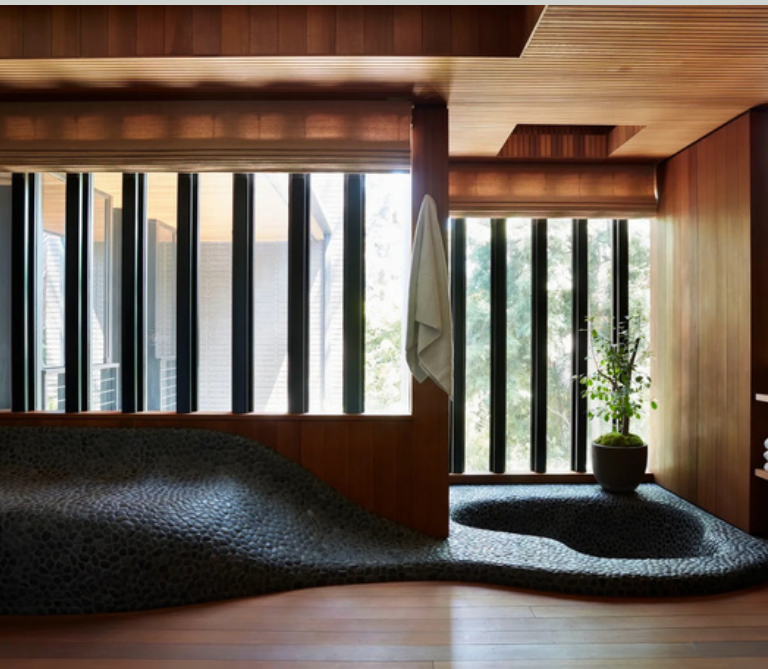
Pebble Stone Bath & Heated Bench Studio Shamshiri