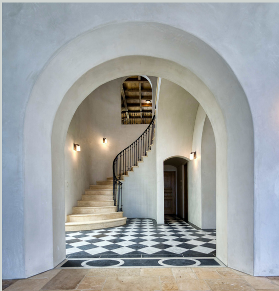
Flooring & Staircase Richard Manion Architecture