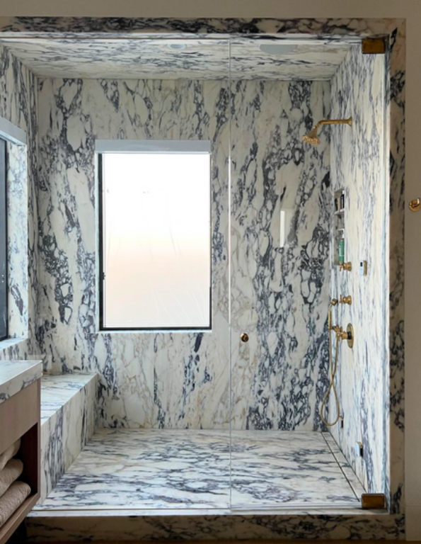
Marble Shower The Rumo Group