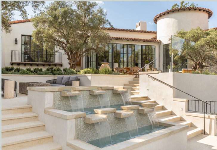
Pavers, fountains, tile Oz Architects