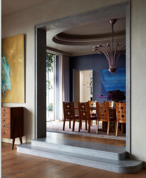
Framing & Steps Mark Drexler & Associates